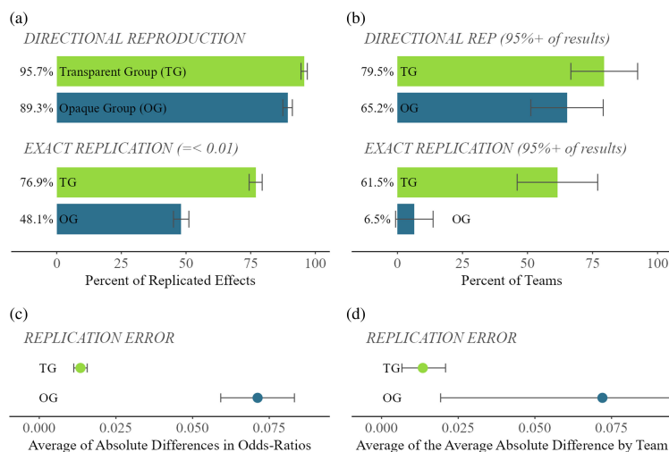
Figure 1. Results of a crowdsourced computational replication from 85 Replicator Teams. Note: The study involved a computational reproduction of Brady & Finnigan [22]. Only the Transparent Group “TG” ( N = 39 teams & 1,872 effects) had access to the original paper and code, while the Opaque Group “OG” ( N = 46 teams & 1,874 effects) had only a description of the methods and no code (see §2 and appendix A). Left-side are effect-level results (a & c) and right-side are team-level results (b & d). Bars represent two-tailed 95% CIs. Differences between experimental groups on all outcome measures are statistically significant at the effect-level with 99% confidence ( p < 0.01 ); at the team-level, this is only true of Exact Replication. The between \sigma^2 (the percentage of the total effect-level variance that occurs between teams, also known as intra-class correlation coefficient [ICC]) are A. DIRECTIONAL REPRODUCTION: TG = 23.9% & OG = 29.4%; B. EXACT REPLICATION: TG = 63.1% & OG = 33.2%; C. REPLICATION ERROR: TG = 39.6% & OG = 93.3%.